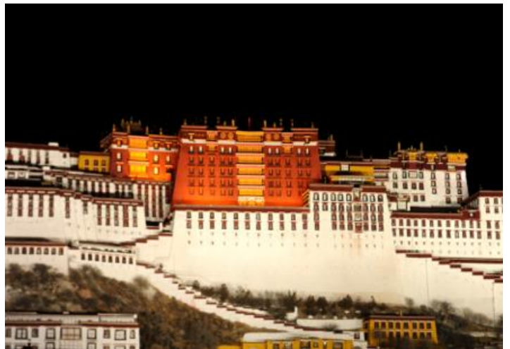
The Potala Palace

Followed the main tour in Qinghai, we will fly either from Yushu or Xining to Lhasa. After checking in our hotel in Lhasa city, we will visit Jokhang Monastery. Founded in 650 AD by Sontzen Gampo, one of Tibet's greatest monarchs, Jokhang Monastery is known as the religious center of Tibet and a magnet for pilgrims from all over China. Throughout the day a colorful throng circumambulates the temple, the pilgrims chant and prostrate themselves. Inside the monastery, past rows of prayer wheels, are dark chapels containing a bewildering richness of frescoes and statues. We will also walk on Barkhor Street to explore local people's life.