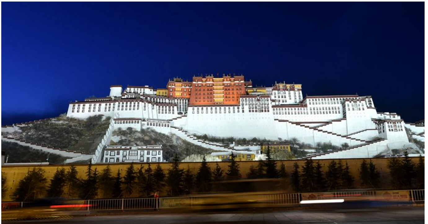
The majestic Potala Palace