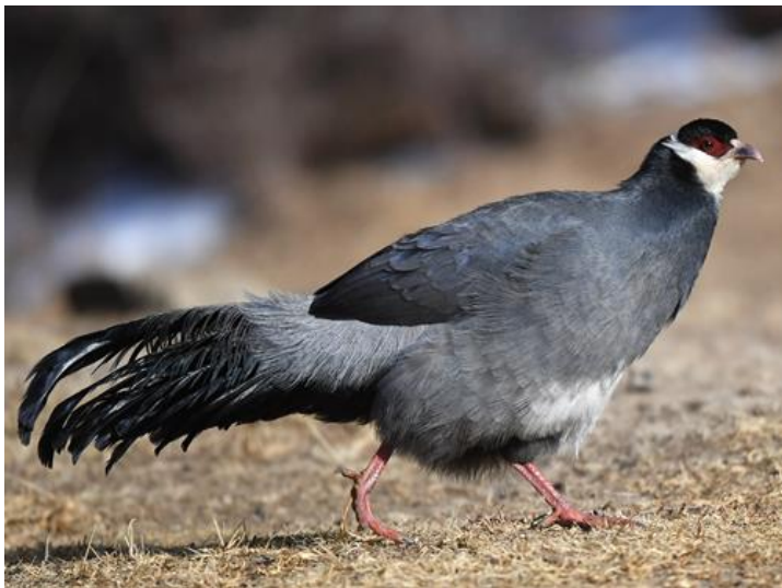
Tibetan Eared Pheasant

For cultural exploration, we will visit the famous Potala Palace and Drepung Monastery. Potala was built between 1645 and 1694, contains over 1,000 rooms, including numerous chapels, shrines, assembly halls, mausoleums, and is undoubtedly one of the world's most extraordinary and moving buildings. The interlinked 'white' and 'red' palaces tower 13 stories high and completely dominate the city below. The panoramic view from the roof across Lhasa to the mountains beyond is well worth a visit. In addition, Drepung Monastery, one of the famous Gelug sect gompas and the largest monastery in Tibet, is also an ideal place for an immersive experience of Tibetan culture.